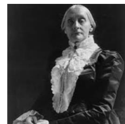
Susan B. Anthony